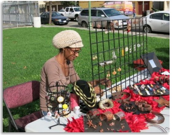
Vendor, Castlemont Community Market