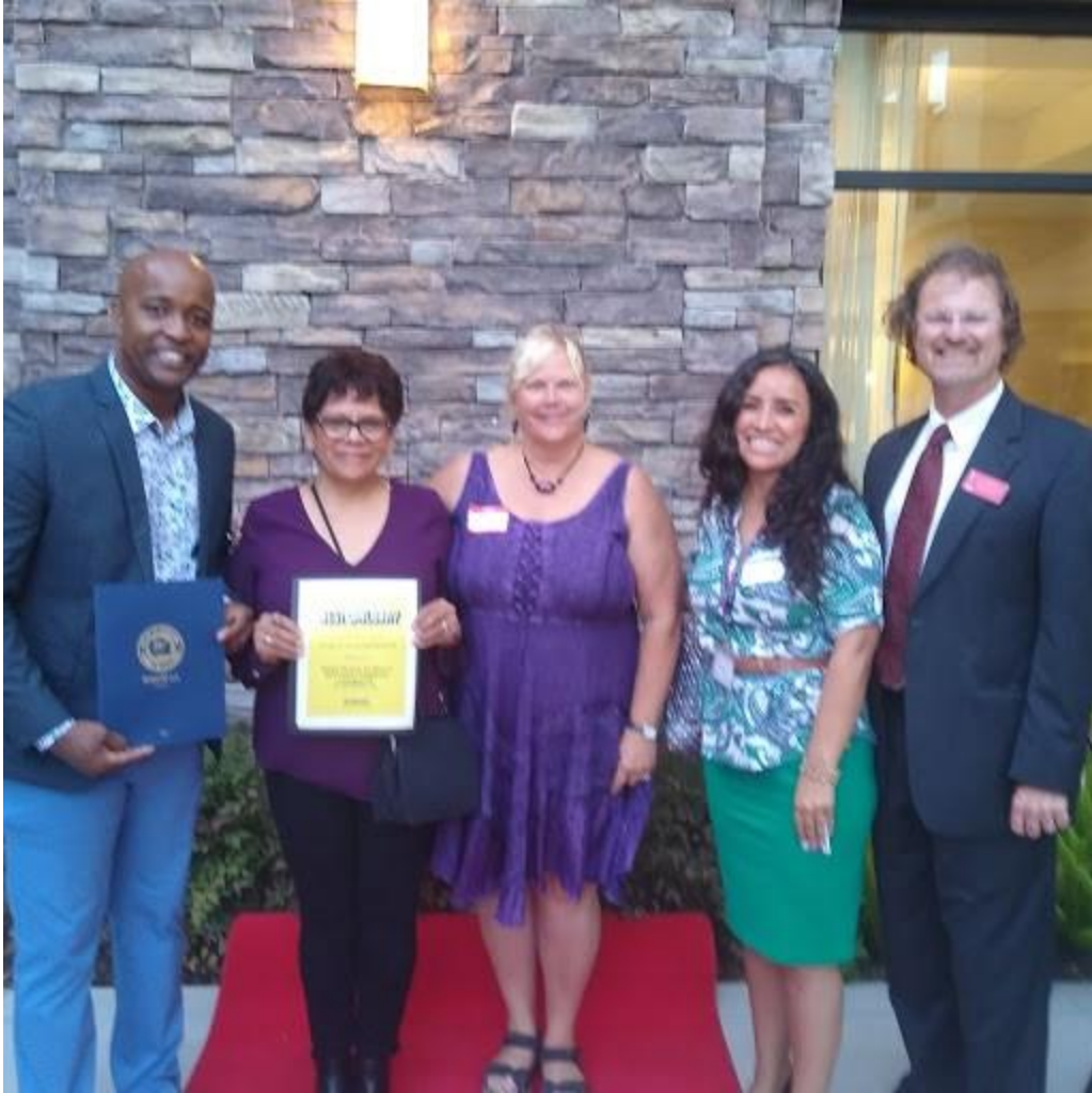
Congratulations to Five Little Monkeys for winning Best Place to Buy a Birthday Present Award at the Albany Chamber of Commerce Best of Albany event.